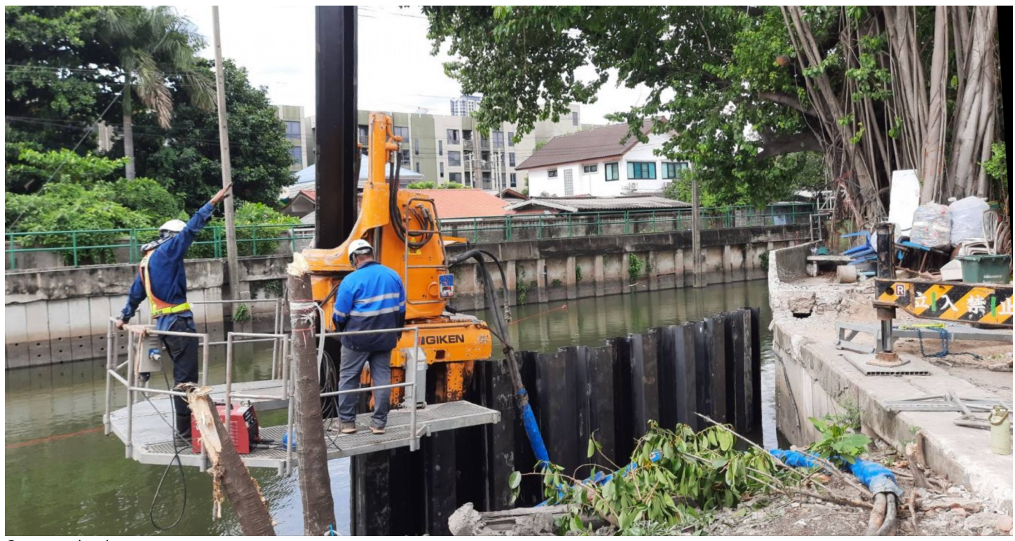
Construction in progress