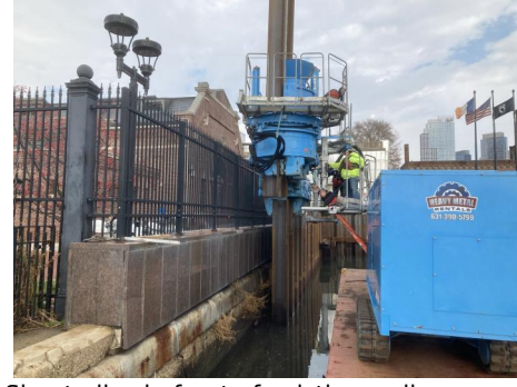
Sheet piles in front of existing wall