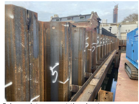
Falsework to support the sheets