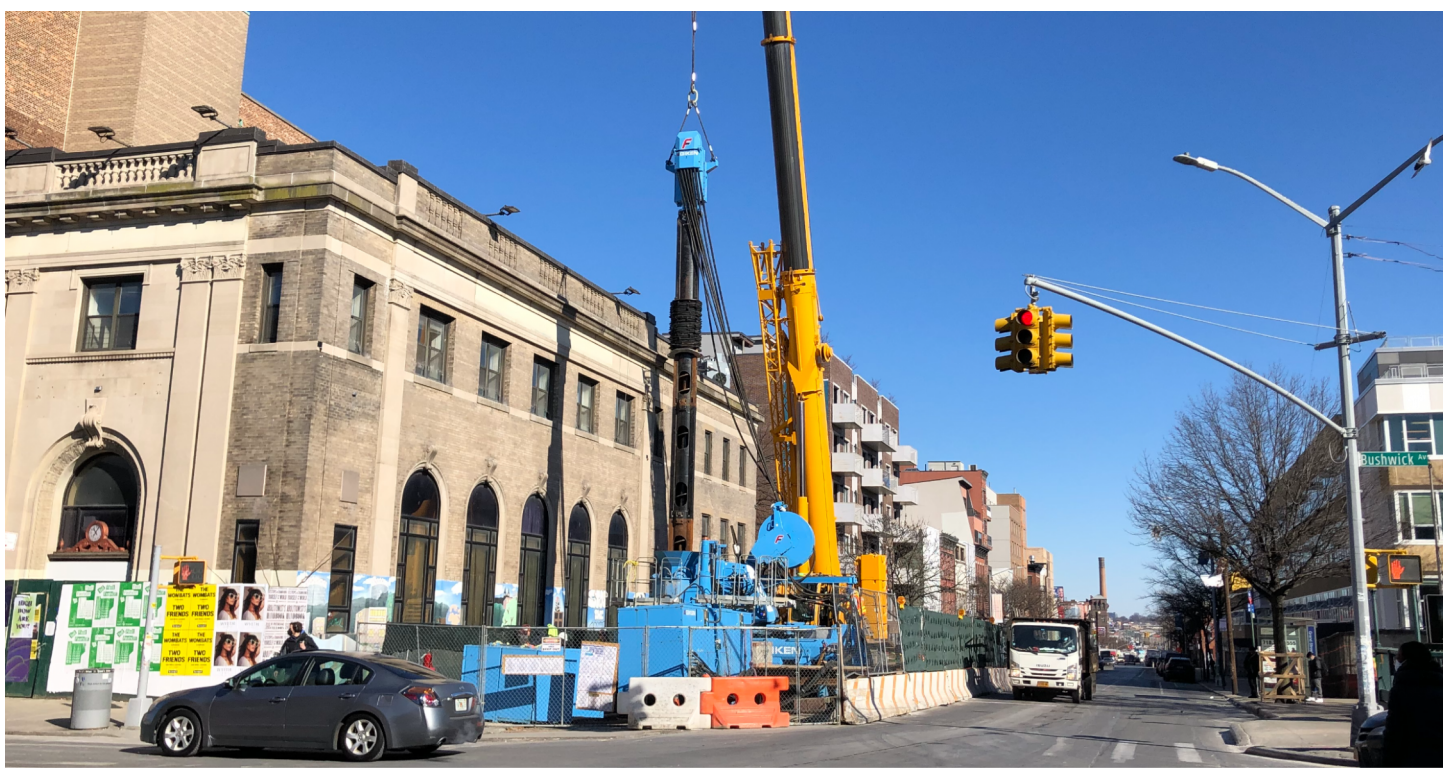
View of the site at Grand St