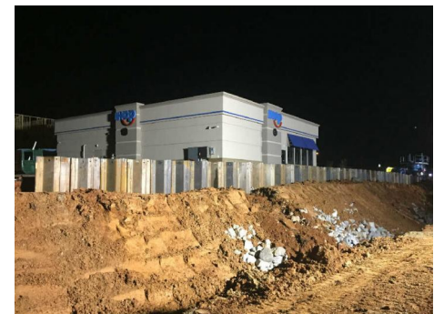
Completion of Sheet Piling