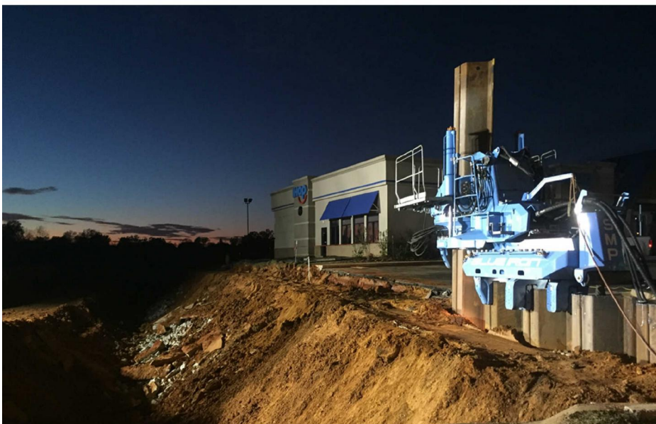
Top: After Parking Lot Collapse Bottom: Sheet Piling