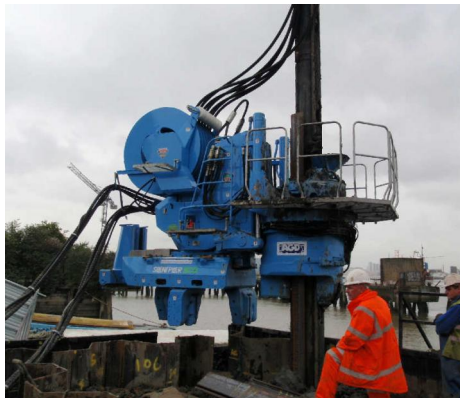
Self-moving at the corner