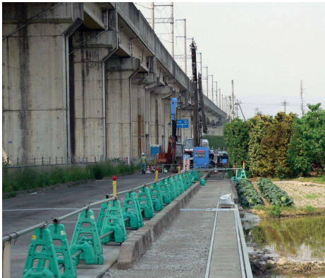
Narrow piling area