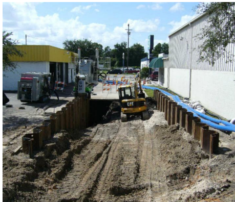
Completion of Sheet Piling