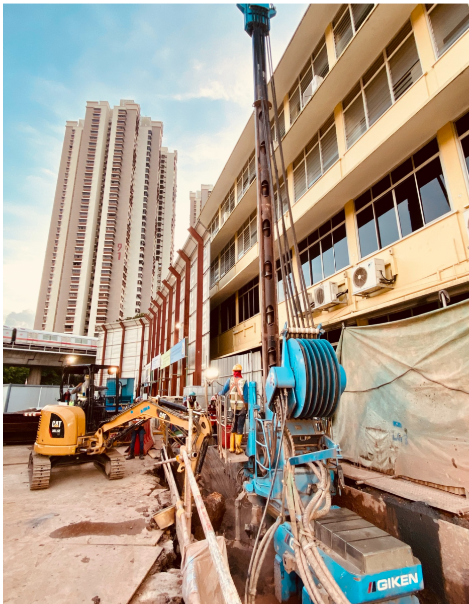
Construction in progress