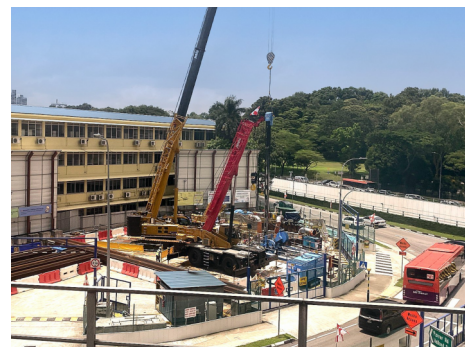
Construction site view