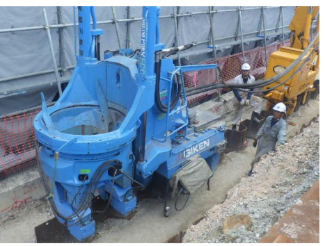
Construction work in progress