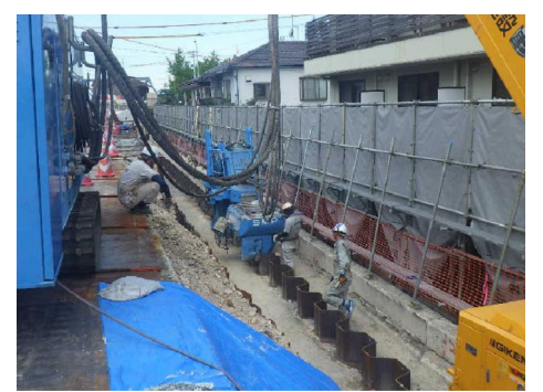
Construction work in progress