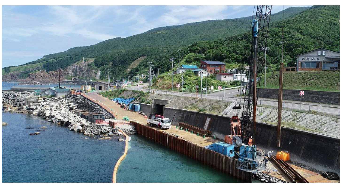
Piling in progress

🔽 U Sheet Pile Press-in Method 🔣 GRB System