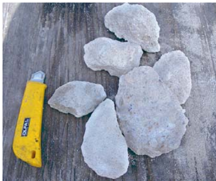
cemmentd Sand and Shell (Coquina)