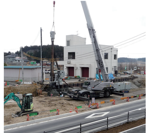
▲ Road Widening Works