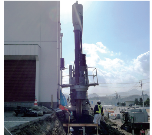
▲ Sheet piling close to an existing building