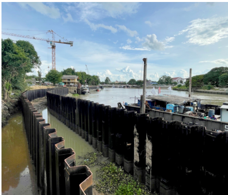
Hat sheet pile double wall