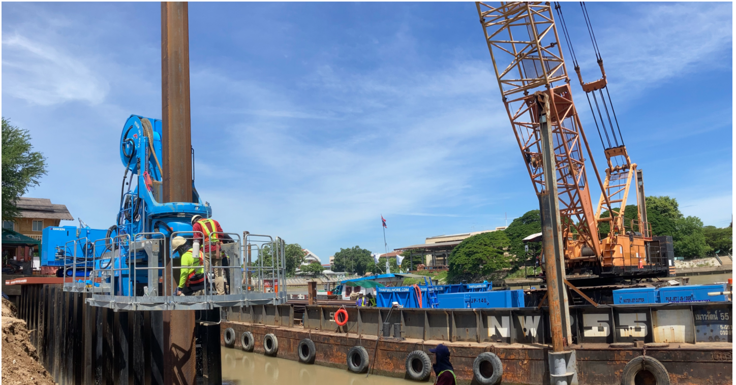
Construction in progress