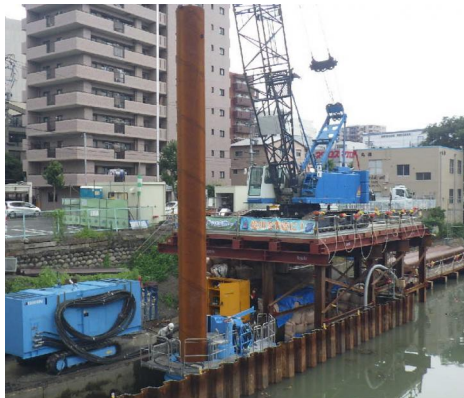
Construction work in progress