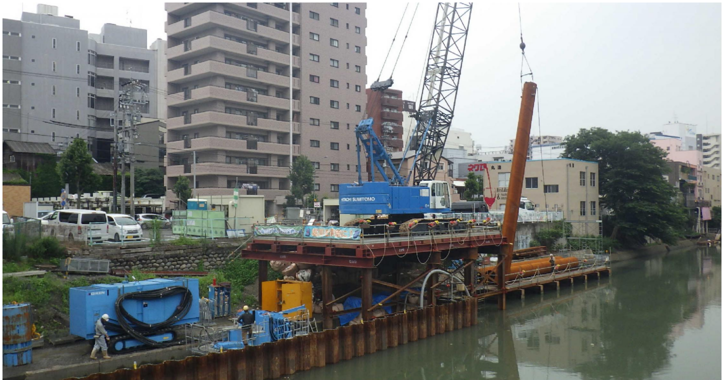
Construction work in progress