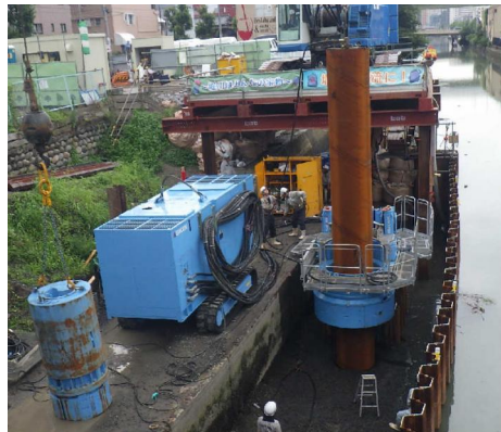
Construction work in progress